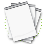
Plastic shipping envelopes