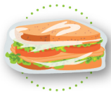
Ziploc & other reclosable food storage bags