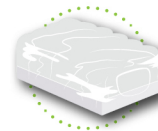
Wood pellet bags