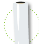
Pallet wrap & stretch film